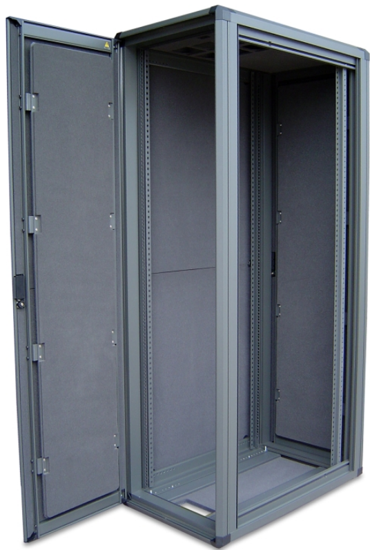
Image: Offset Rear of Rack with Side Panel Removed Model AR-42U600x1000-G - 42U

The AcoustiRACK™ acoustically treated enclosures are self-venting cabinets that have been designed to trap and absorb unwanted noise generated inside whilst allowing free air movement and heat exchange with the outside of the unit for cooling.