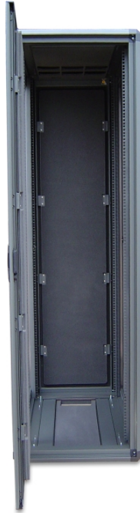
Image: Front View with Door Open Model AR-42U600 x1000-G - 42U