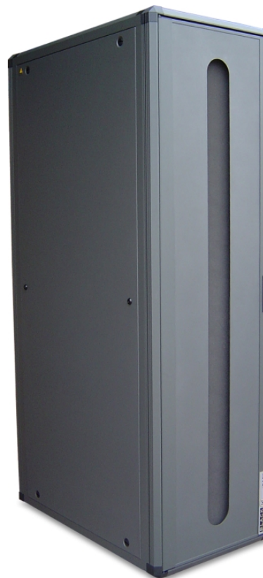
Image: Front Offset Side View Model AR-42U600x1000-G - 42U

Recent changes to directives & legislation show the general trend is one towards much lowered tolerance of workplace noise levels.